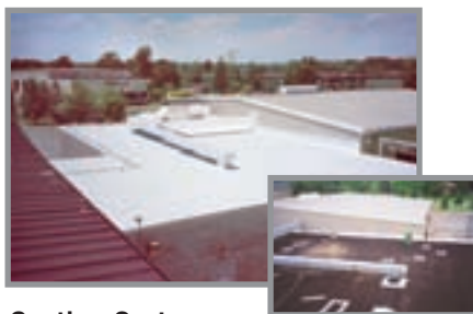
Coating Systems For built-up, modified bitumen & granular cap sheets

The Uniflex® Elastomeric Coating System provides a highly reflective white finish reducing thermal shock, movement, and cooling costs. Outstanding performance utilizing the latest generation 100% acrylic polymer providing long term waterproofing protection.