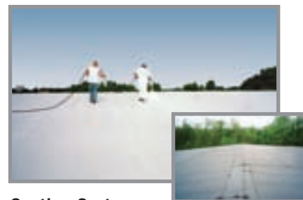
Coating Systems For single-ply roofs

Uniflex offers several coating options for your built-up or modified bitumen roof to help meet your specific needs and budget. We can help with a basic asphalt emulsion system, aluminum coating or our premium white elastomeric system incorporating our Elastomeric MB BaseCoat that provides outstanding adhesion over asphalt surfaces. The highly reflective white finish provides maximum energy savings and waterproofing protection.