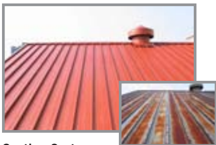
Coating Systems For metal roofs

Uniflex was the first to introduce a quality aluminum fibered coating to the metal roof industry in 1946. That product, Uniflex 500, is still in demand as an economical, long-term solution to metal roof corrosion and leaks.