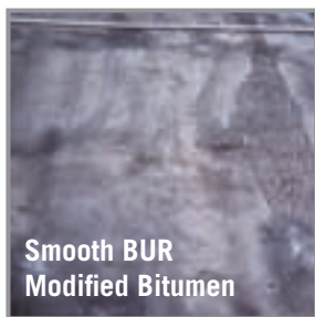
Smooth BUR Modified Bitumen